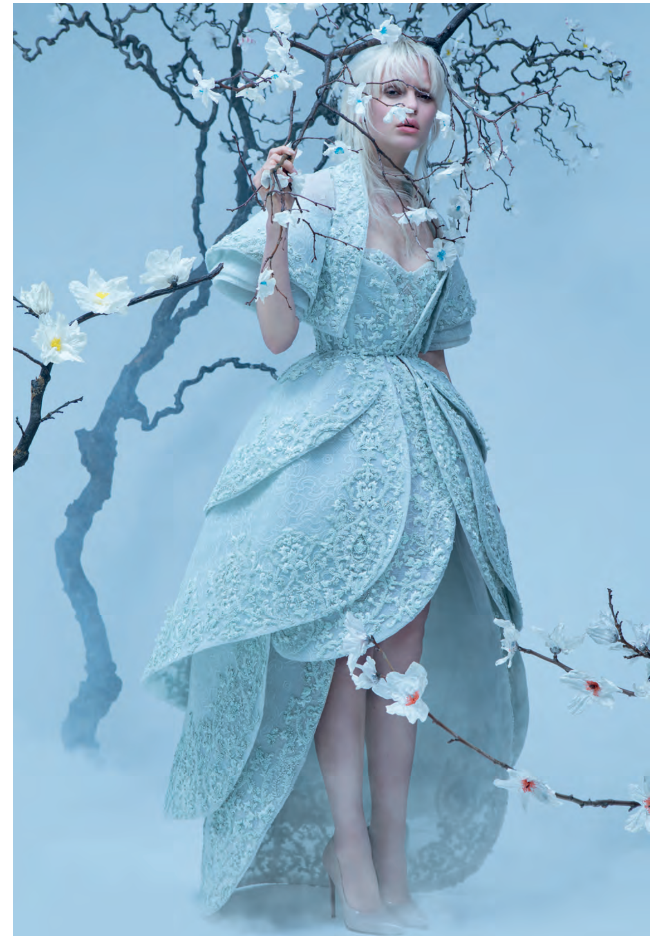
Ashi Studio dress, Steiger Paris shoes. Opposite page, Georges Chakra dress.