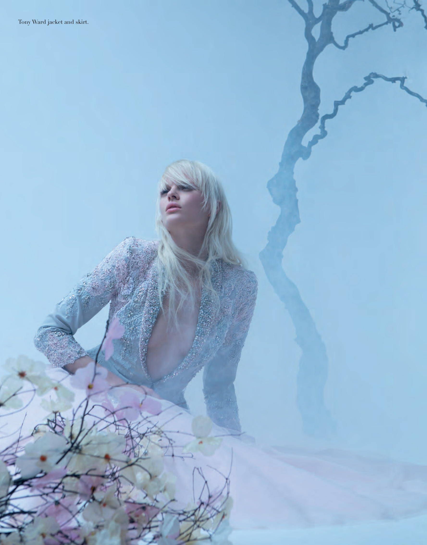
Tony Ward jacket and skirt.