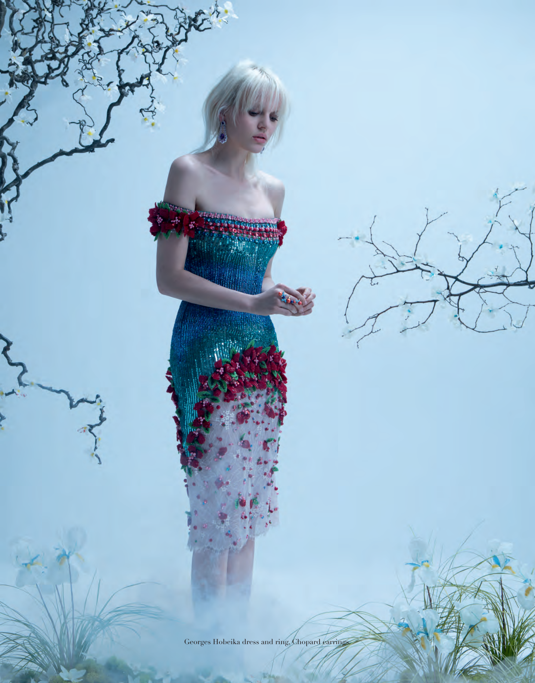
Georges Hobeika dress and ring, Chopard earrings.