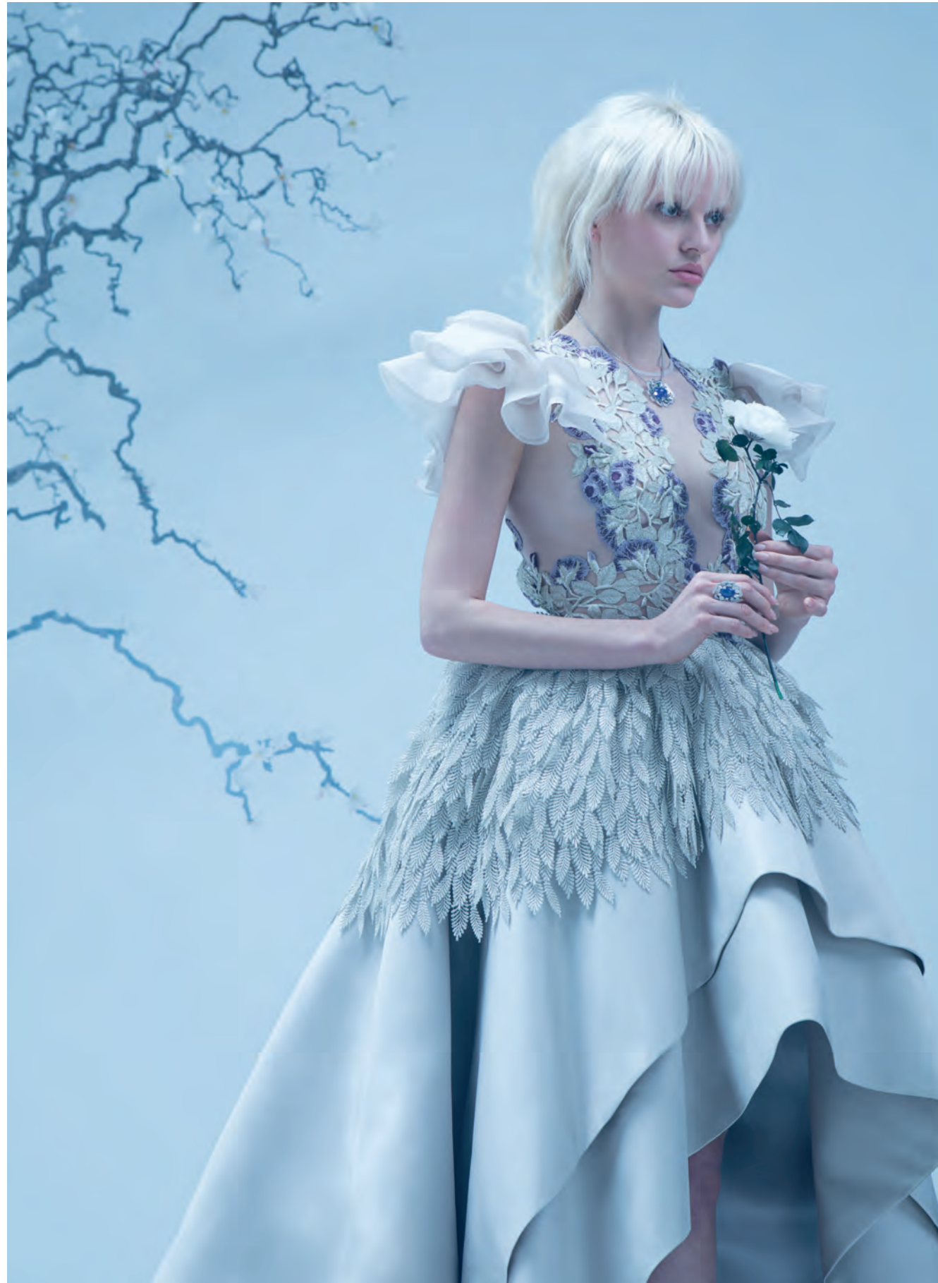
Dany Atrache dress, Philippe Tournaire necklace and ring. Opposite page, Jean Paul Gaultier dress, boots and ear cuff.