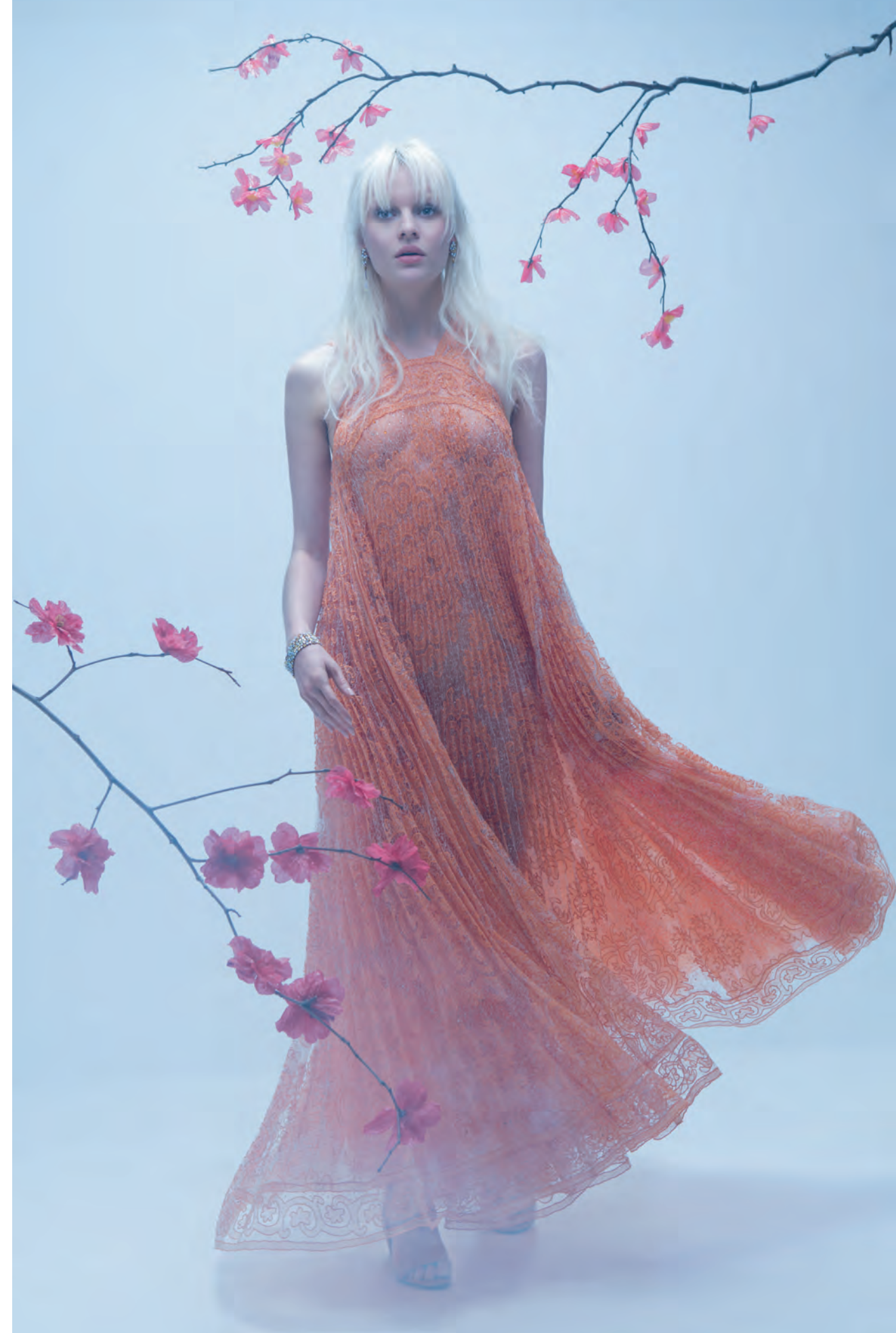
Giorgio Armani Privé dress and shoes, Damiani earrings and bracelet. Opposite page, Guo Pei dress, Damiani ring.