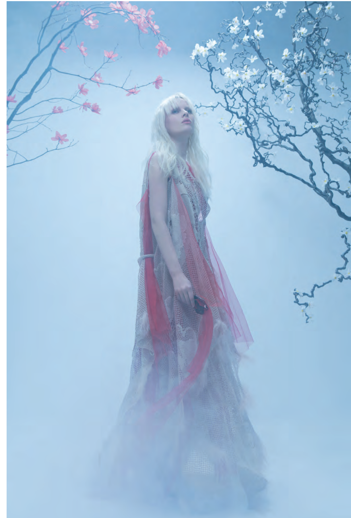
Maison Margiela Artisanal designed by John Galiano dress, Boucheron necklace. Opposite page, Elie Saab Haute Couture dress, Chopard ring.