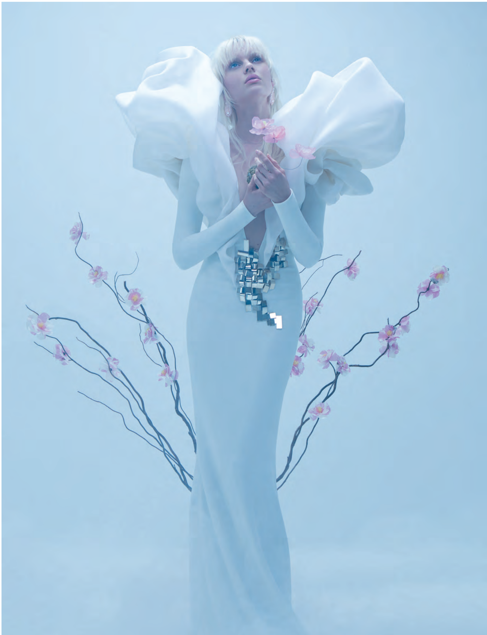
Stéphane Rolland dress, Boucheron earrings.