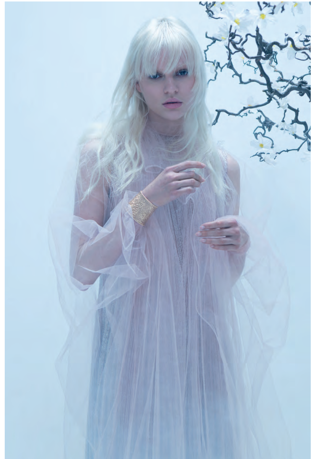
Valentino dress, Van Cleef & Arpels bracelet.